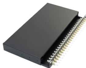
A. Sliding drawer design

The Excel range of LC patch panels are sliding drawer ‘tray style’ housings suitable for either direct termination or splicing of upto 48 fibres in 1U of rack space. Each panel is manufactured from high quality 2mm thick steel and finished in Black powder coated paint to provide a strong and durable unit. To the front of the patch panel the specified number of duplex adaptors are loaded from left to right. The fascia also houses the release latches for the sliding drawer. Each panels utilises colour coded adaptors, Beige for multimode, Blue for singlemode. Each duplex adaptor accommodates two terminated fibres. Each panel has included within it a set of adjustable fixingarms, and a cable management pack which includes cable entry glands, cable ties, and a 24 way splice bridge.